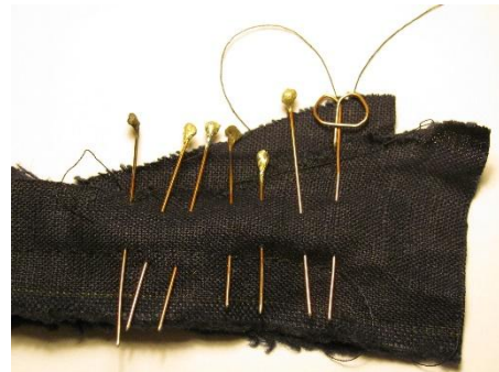
The resulting costuming pins – courtesy of Lord Lowrens

An introduction to period footwear and its construction thanks to Lady Eleanora was hugely beneficial and got many interested in a new pursuit the joy of the advancement dream.