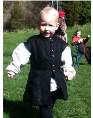
Image of the youngest attendee proudly parading his Renaissance garb