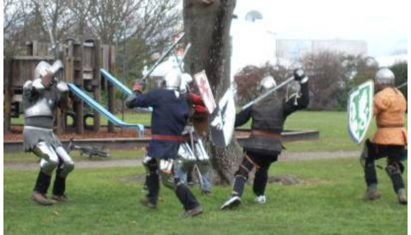
Looks like fun: Sunday morning Fighters' Practice attendees have a melee

The options for obtaining armour etc have never been better. People usually have either time but no money or money but no time. Within the SCA there is a tradition of teach and be taught along with bartering so there are various avenues for obtaining/making armour. The very process of gathering/making and refining a set of armour may take several years. Getting into armour only takes a discussion at Fighters Practice as there is generally loaner gear available. Again enthusiasm has a huge part to play here. People will go out of their way to help an enthusiastic new fighter. All that is expected in return is a commitment to attending Fighters Practice regularly.