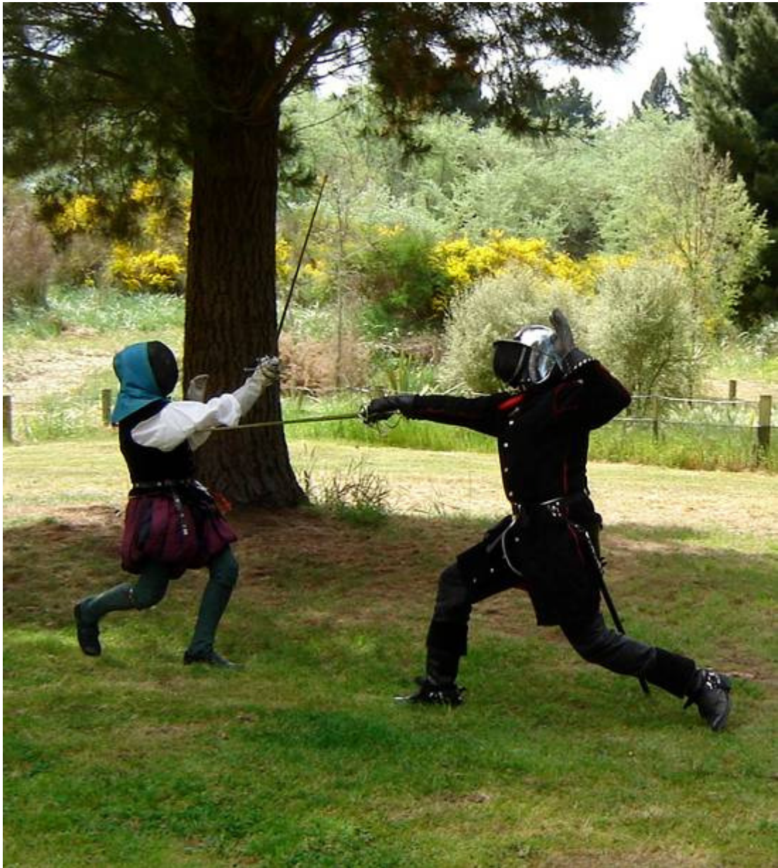
Two late-period types practice their blade-work