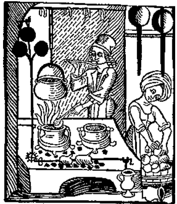
"A detailed kitchen scene"

I am a big fan of cooking stew in a slow cooker or in a covered dish in the oven. My reason behind this is that medieval cooks used very thick pots and did not hang these over the hottest part of the cooking fire. The oven or slow cooker can provide even, less direct heat, similar to what happens when you put a stew pot on the hearth not too close to the fire. Stew cooked on a stove top requires constant tending as large pots are often thin and conduct heat too fast and in the end result can in scorched stew. If you do have a scorching incident: do not stir (it will just mix the nasty bitter stuff in), stop the cooking immediately, ladle (not pour) the stew into a clean pot, leaving a thick layer at the bottom. This may seem wasteful but it better to have less stew than a whole lot of something inedible. A little sugar may also help correct the scorched taste but if it is really bad then it may just need to be binned. If you must cook on the stove top due to oven restrictions then ensure you have one person dedicated to watching it and stirring it frequently. Remember stew is fine if cooked ahead and it freezes well. Do not freeze it volumes greater than two litres or it will take too long to defrost.