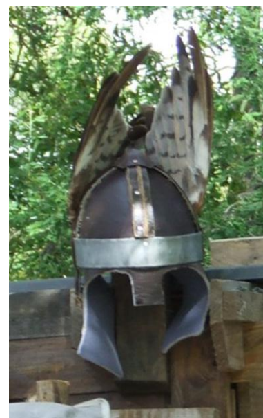
Some of the helms to be seen at Canterbury Faire 2012