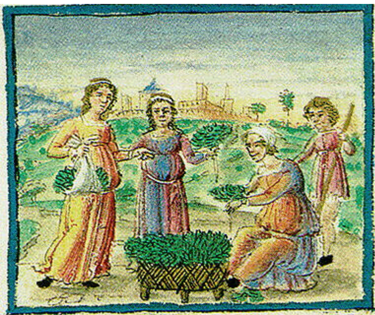
Lettuce; from the Tacuinum Sanitatis, Österreichische Nationalbibliothek, Vienna, Codex Vindoboniensis 2396

http://www.godecookery.com/afeast/foods/food020.html