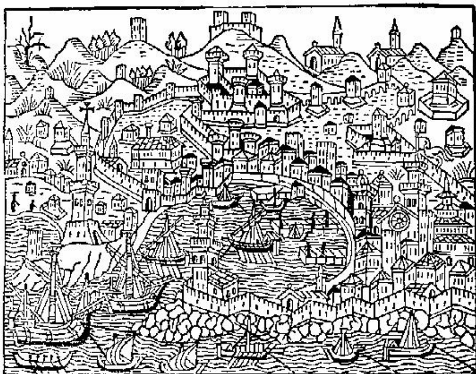
View of Genoa, from the Supple- mentum Chronicarum , Venice 1486.