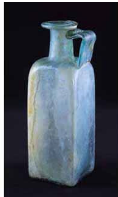
Square-sided bottle Early 2nd century A.D. Ht., 16.4 cm

http://www.museum.upenn.edu/new/research/Roman%20Glass/index.html