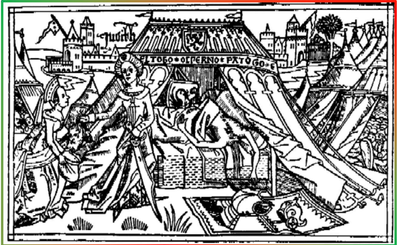
A bed in a tent, medieval camping.