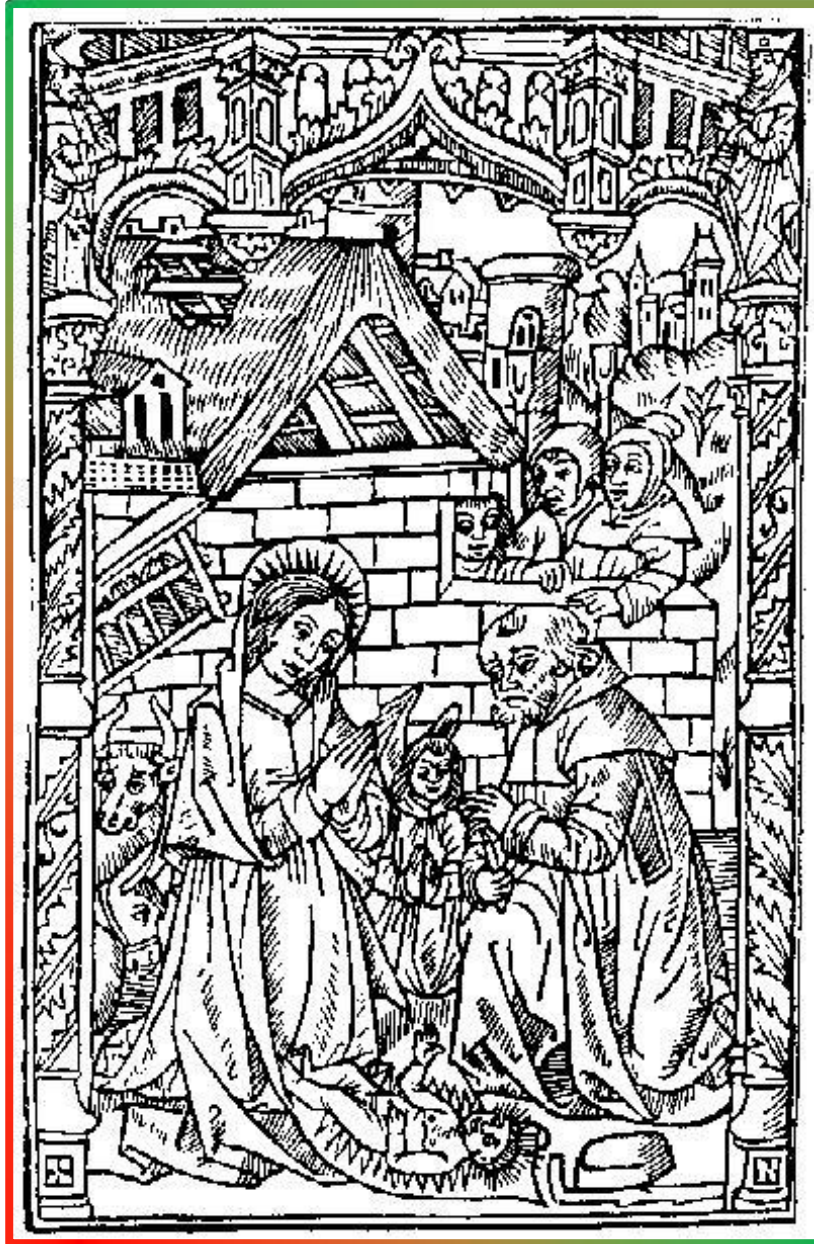
The Nativity, from Horae , London (Pynson), about 1497.