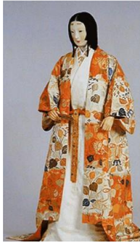
Fig 3: Muromachi Period Garb