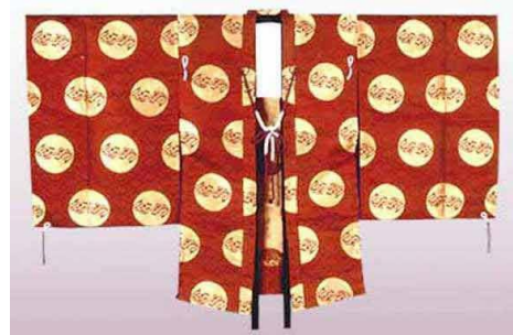
Fig 5: Mens hitatare

Along with clothing, a well-dressed Samurai of the Kamakura period would also require the following: