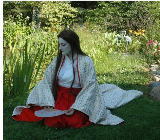
Fig 4: Kamakura period garb (also suitable as informal Heian garb)