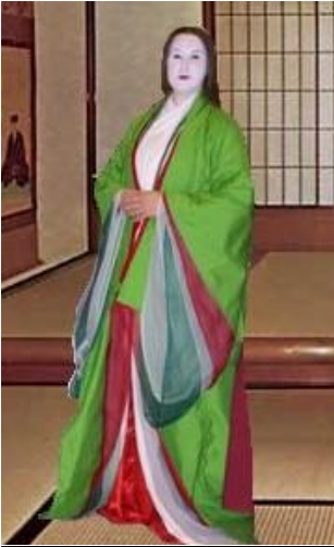
Fig 2: Heian Period garb

Here are some examples of what you might see when researching: