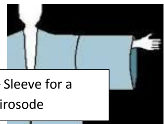
Fig 1 – Sleeve for a hirosode

Note that it can be difficult to find visual examples of this style of dress. Some of what you will see if you look on the internet will be clothing either from the Heian period, or of the following Muromachi period (where well-dressed