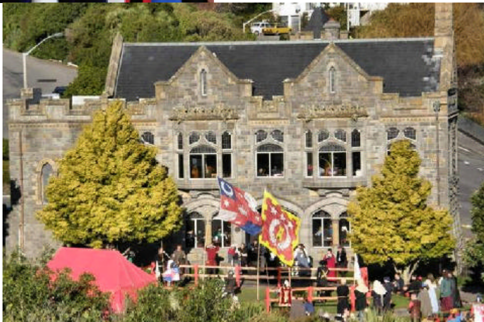
Images from Coronation

Barony of Southron Gaard August AS XLII (2007)