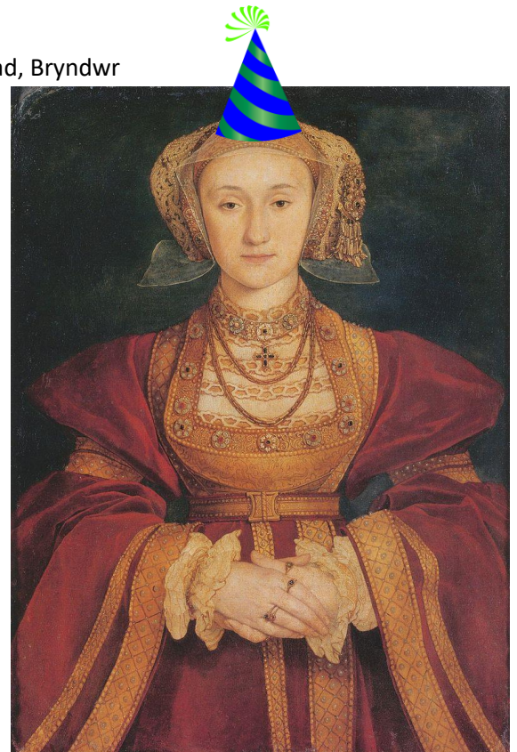
Anne of Cleves, by Hans Holbein, public domain. Plus a bit from your editor. Apparently the steward liked the ad your editor created...