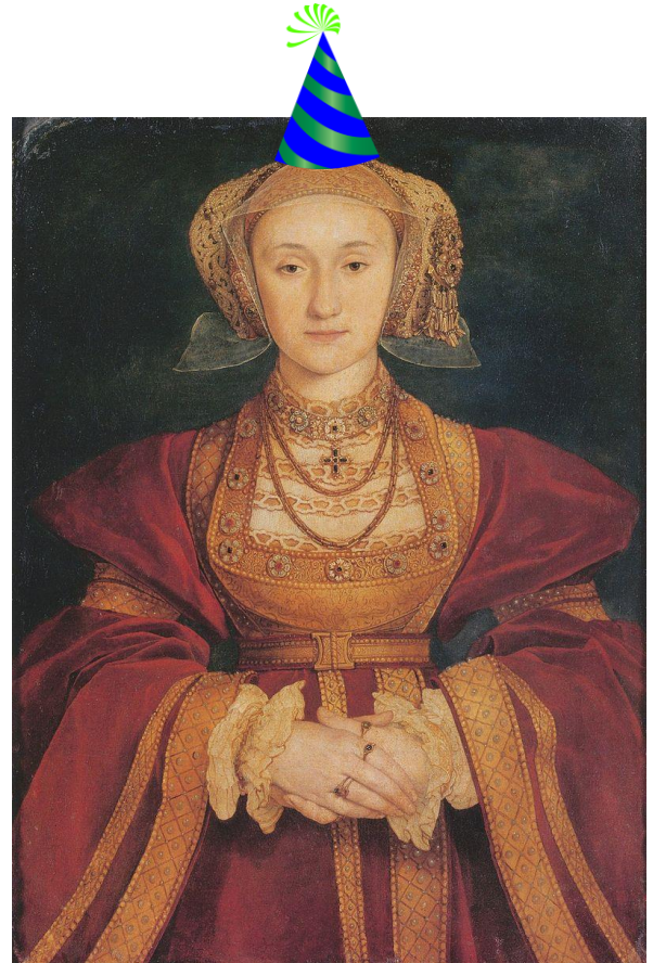
Anne of Cleves, by Hans Holbein, public domain. Plus a bit from your editor. If only the steward has placed an ad...