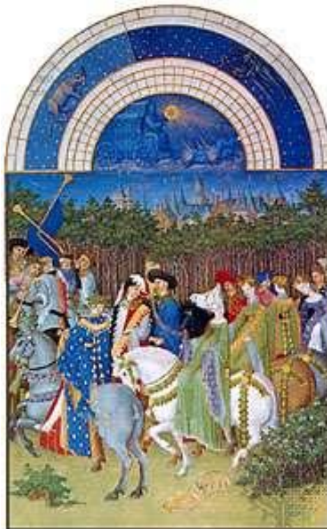
The illustration for May from Les Très Riches Heures du duc de Berry , manuscript illuminated by the Limbourg brothers, 1416; in the Musée Condé, Chantilly, France.

These are lovely in pita bread with some of the eggplant dip from above